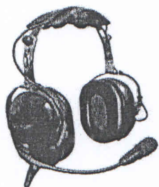
Transair TA200 Headset Price £129.95

You may also be interested in some of our new products.