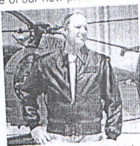
Professional Leather Flight Jacket Price £159.95